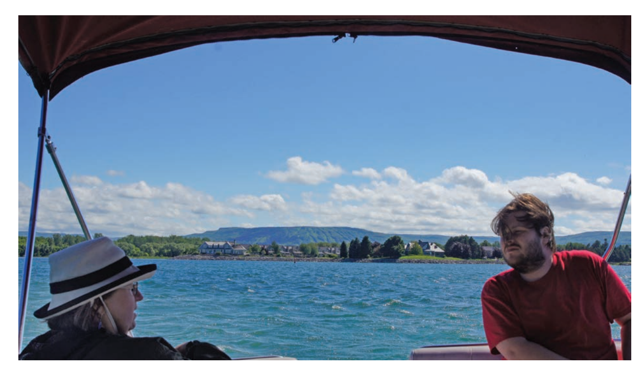
◆ The Niagara Escarpment rises dramatically south and west of Collingwood. View from Georgian Bay.