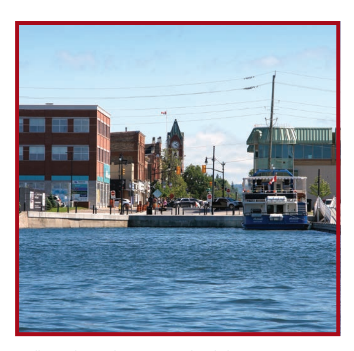
\blacktriangle Collingwood's main shopping street ends at the bay.

After hearing about the health benefits of fresh-pressed, extra-virgin olive oil, we were given a tiny paper cup of Greek olive oil to swirl in our mouths just as if it were wine.