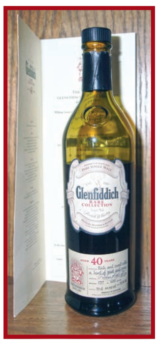
▲ The bottle of 40-year-old Glenfiddich which costs $615 for a generous dram.

Beaver Valley section. The trail passes through mature trees including cedars and apple trees. Gradually going down to a lower elevation, we came upon beautiful wildflowerfilled meadows and a creek that feeds the Beaver River.