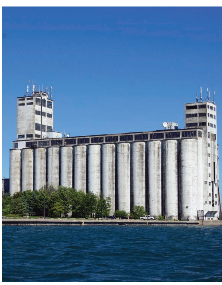
\blacktriangle The famous Collingwood grain terminals from the little-seen bay side.