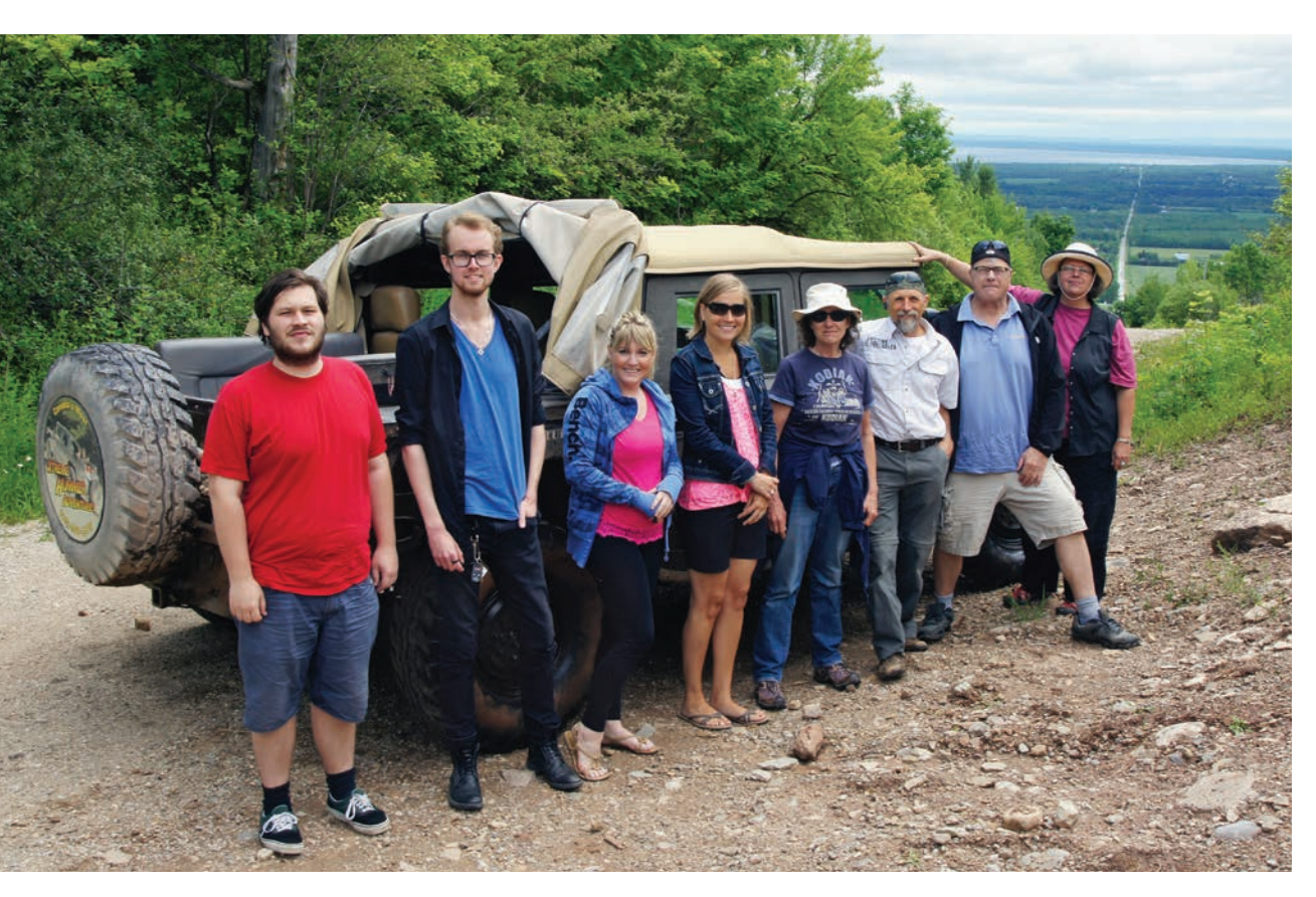
◀ The lucky few who were treated to a day of touring some of Collingwood's attractions.